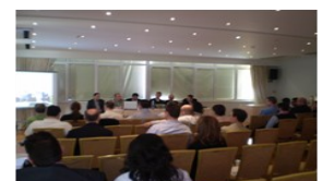
The National Conference on 9 October 2011

learning method and the governing bodies and service providers of life-long learning in Greece.