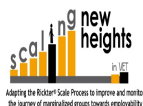
Adapting the Rickter® Scale Process to improve and monitor the journey of marginalized groups towards employability

Since October 2011, KMOP participates in 2 different