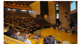
The First Annual convention of the European Platform against Poverty and Social Exclusion.

heart of its economic, employment and social agenda. - the Europe 2020 strategy-. Heads of State and Governments of 27 Member States have agreed a major breakthrough: a common target that the European Union should lift at least 20 million people out of poverty and social exclusion in the next decade.