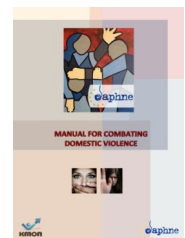
The booklet of KMOP

The booklet of KMOP "Combating Domestic Violence" is a complete guide addressed to all kinds of professionals that have contacts with victims of domestic violence. KMOP will participate in the Final Conference in Brussels ( 21-23 November 2011 ).